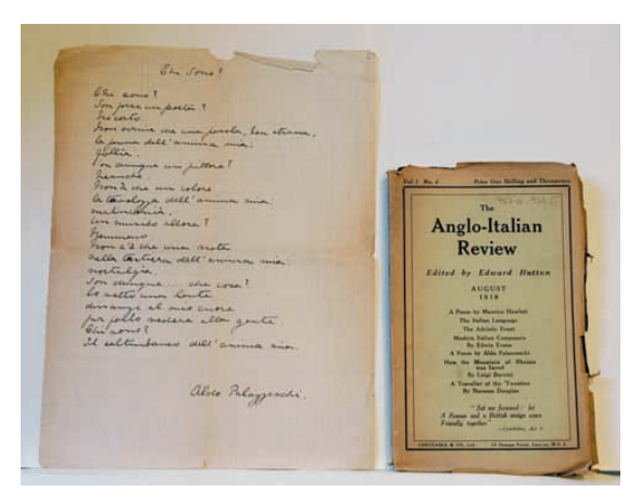
The manuscript of Chi Sono? by Aldo Palazzeschi, written in 1918 for Edward Hutton's "Anglo-Italian Review" and published in August 1918.

The Palazzo Lanfredini is attributed by Vasari to Baccio d'Agnolo and it was constructed in the early sixteenth century for the banker Lanfredino Lanfredini. The palazzo underwent major renovation and alterations in 1904 and 1938 and the British Institute occupies part of the ground floor with its vaulted rooms and part of the piano nobile with its arcaded verone loggia. The move into the Palazzo Lanfredini was barely completed when, on 4th November 1966, the Institute suffered a small share of the damage caused by the catastrophic flood.