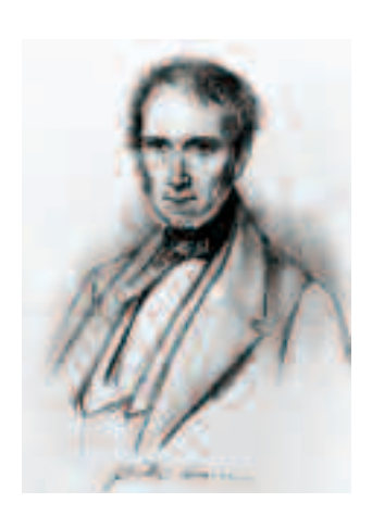
Portrait of G.B. Amici

ther the most favourable for observations nor the most comfortable for the observer. Without even considering the state of its horizon, which is dominated (with the exception of only one side) by buildings and the nearby hills, whoever chose the collocation of the observatory failed at the outset. The meridian openings of the fixed instruments are neither comfortably nor readily practicable. Moreover, the building continues to move slowly towards the West, which causes continuous alterations in the instrumentation."