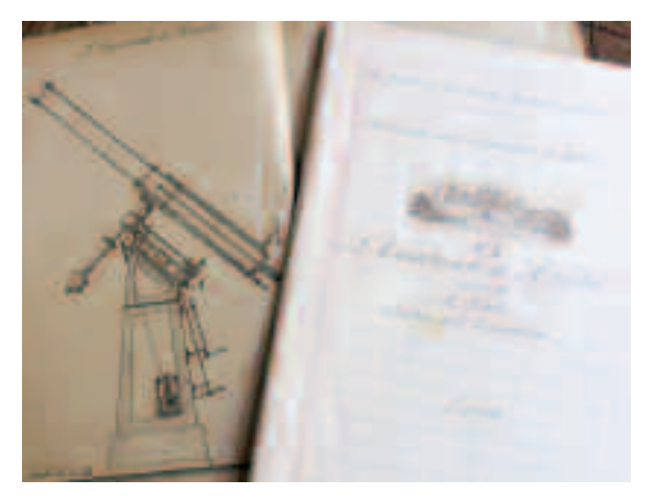
Printed version and handwritten manuscript of the first issue of "Pubblicazioni dell'Osservatorio di Arcetri" 1893