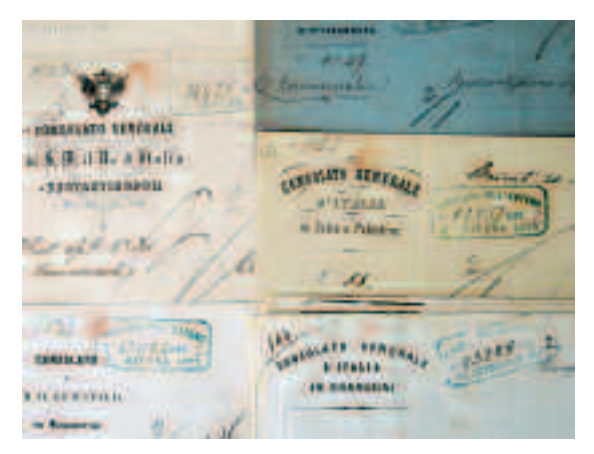
Papers concerning Donati regarding the aurora borealis of 1872, on which occasion the astronomer collected information from all over the world

1872. His correspondence contains scientific collaborations, administrative documents and many papers concerning his work, particularly manuscripts describing observations of eclipses and comets starting from about 1857.